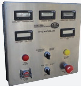
CONTROL PANEL MODEL: DSCN2327

POWERFORCE® generators are packaged in a purpose built generator set assembly and test facility. The POWERFORCE® engineering team have many years of experience in designing packages for both the prime and standby power markets. Each POWERFORCE® generator set is packaged and tested by highly experienced technicians which are available to schedule start-up and support.